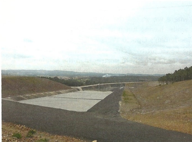
A landfill in Portugal that is yet to be filled with waste.

A landfill is a site for the disposal of waste materials by burial and is the oldest form of waste treatment. Today much of the waste can be reclaimed by using different methods, basically burning some materials for energy and recovering others.